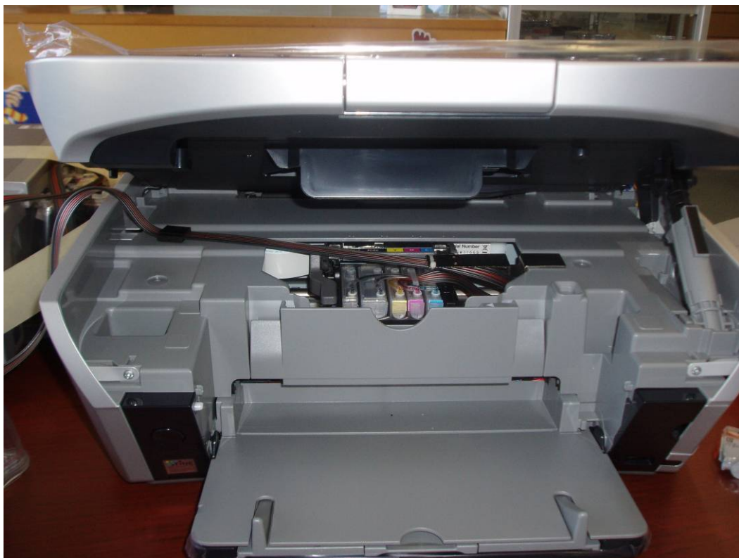
Installed CISS system on a Canon MP500 series printer

Please use this amendment in addition to the existing instruction manual to assist you in installing the RIHAC CIS System.